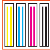
1st head: CMYK