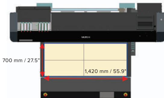
Max. media thickness: 150 mm / 5.91" Max. media weight : 50 kg/m 2

The XPJ-1462UF offers both table space and strength, accommodating heavy or thick media. It opens the door to diverse applications, ranging from small items to larger objects, enhancing productivity and reducing delivery times. The vacuum table features 4 suction force levels (strong, medium, low, and off) to effectively secure various media types.